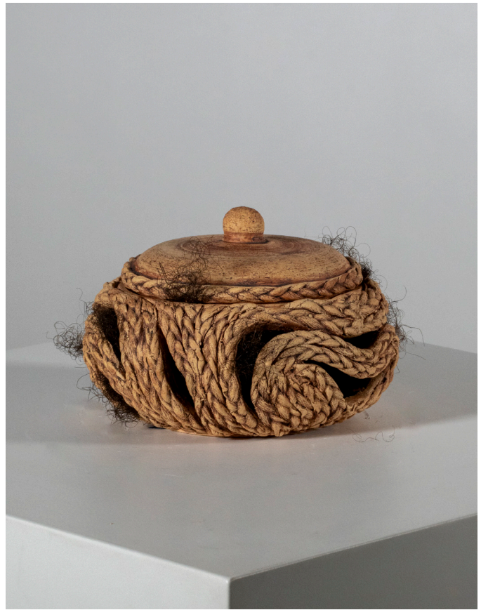
Hair Urn Ceramic and hair of the artist 4.5 x 4.5 x 3 in. 2025 NFS