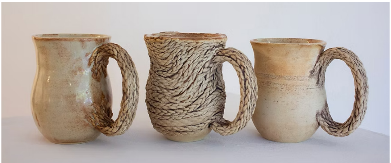
HAIR Mugs Ceramic 6 x 4 x 5 in. 2025, Ongoing NFS, Styles Vary