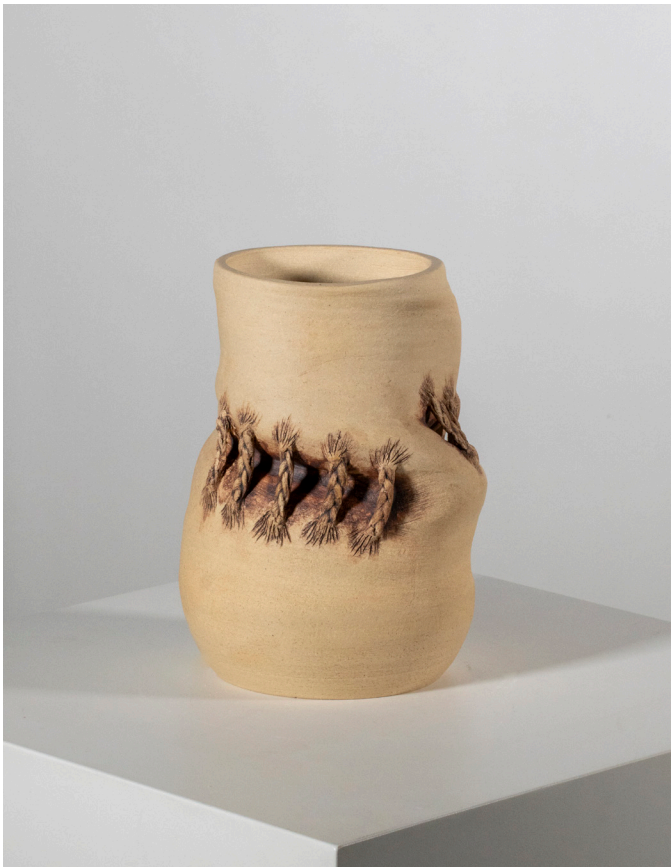
TENSION Vessel #3 Ceramic 7 x 7 x 6 in 2025 SOLD