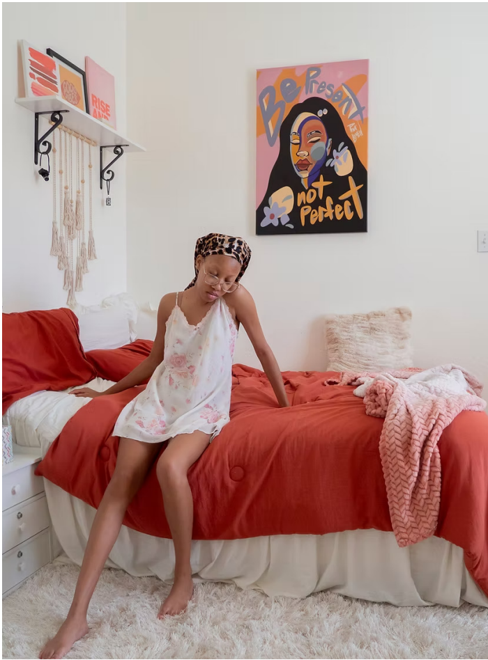
Blue Monday Digital Photography Dimensions Vary 2024