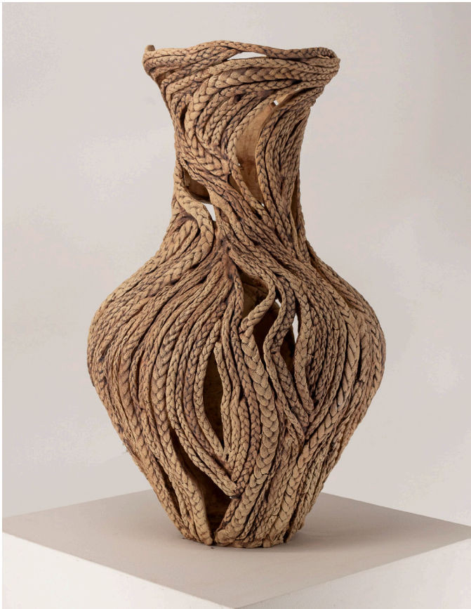
HAIR Vessel #1